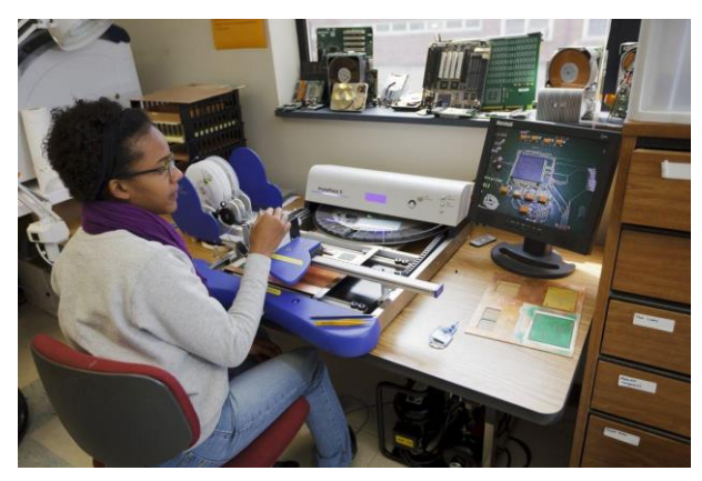
Figure 2 - A Shippensburg University student using ProtoPlace

The equipment transformed the educational experience of juniors taking the CMPE322 Microcontrollers course. Students learn typical programming and interfacing tasks using reference boards. By the end of the semester, students are partnered and tasked with identifying a problem. They must then list the requirements necessary and develop a custom microcontroller system to interface with at least one external IC, communicate with another computer, and solve a definable problem. Using OrCAD & Allegro Shippensburg University students do schematic capture and PCB layout and submit a bill-of-materials for purchasing. They use the LPKF equipment to manufacture their circuit boards, electrically test, program, and demonstrate a working embedded system.