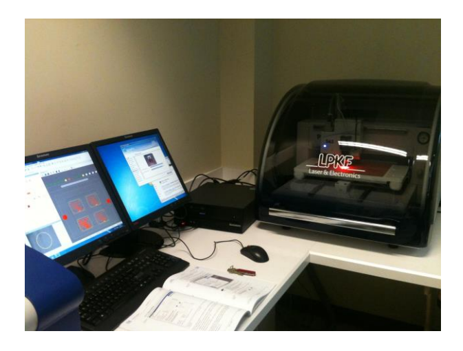
Figure 1 - ProtoMat S63 at Shippensburg University

Shippensburg University is a public, comprehensive liberal-arts university with about 7,000 students. We launched our Bachelor of Science in Computer Engineering in 2011, and a Bachelor of Science in Electrical Engineering in 2014. In response to the feedback from our industrial partners, all our engineering programs feature a balance of traditional engineering lectures and real-word experiences that inspires students to learn and build confidence for becoming professional engineers.