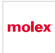
Molex Connector Corporation (USA) www.molex.com