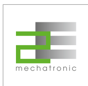
2E mechatronic (Germany) www.2e-mechatronic.de

These manufacturers are a reliable source of LDS parts: