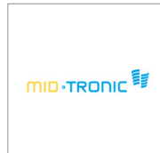
MID-TRONIC Wiesauplast GmbH (Germany) www.mid-tronic.de