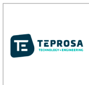
TEPROSA GmbH (Germany) www.teprosa.de