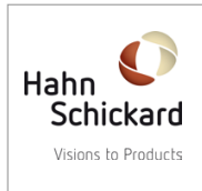
Hahn-Schickard (Germany) www.hahn-schickard.de