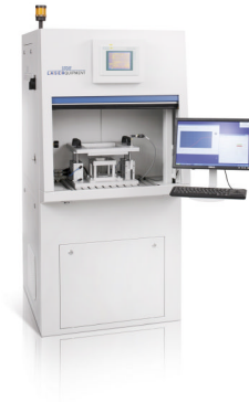
Figure 2: The LQ-Vario, installed in LPKF's Detroit location, can be customized to each production requirement.